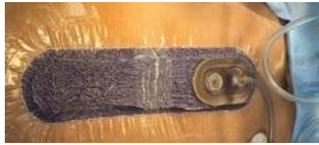
Prevena (Pressure Dressing)